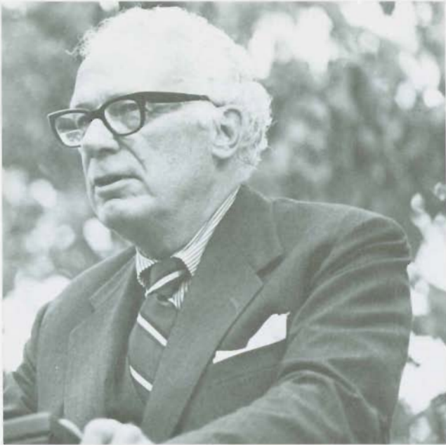
George W. Ball was U.S. Undersecretary of State from 1961-1966. In this capacity he served as deputy and personal friend to Dean Rusk during an important period of U.S. history. He was invited to the dedication ceremony to add his personal reflections on Rusk's achievements and character.