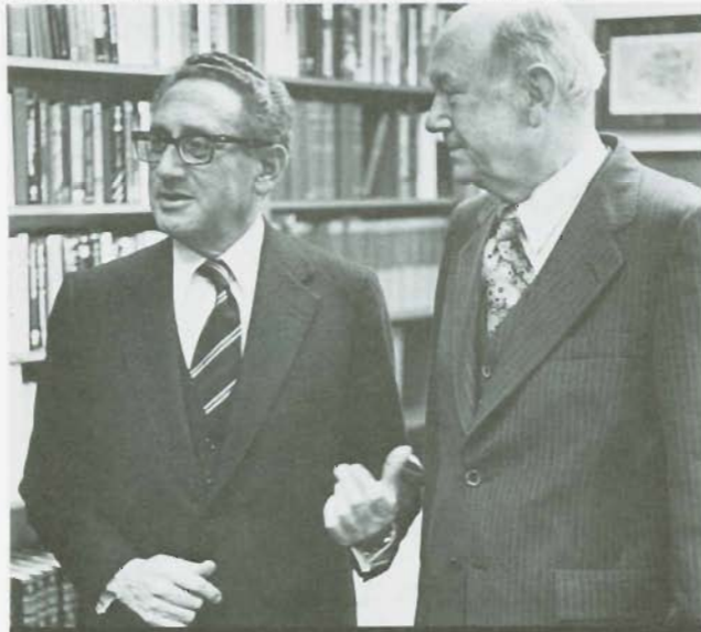
Two former U.S. Secretaries of State spend a few moments deliberating on strategies for world peace or other topics approachable only by those whose common diplomatic decision-making and crisis-handling experiences qualifies them in a unique manner. Henry Kissinger visited the University campus in February as keynote speaker for the UGA Alumni Seminar on the Soviet Union. He toured the Rusk Center for International and Comparative Law and had breakfast with Professor Rusk, who introduced him at the Alumni Seminar. Mr. Kissinger's appearance marks the second time a U.S. Secretary of State has visited the School of Law in ten months. Secretary Vance came to Athens in April 1977 as Law Day speaker.

The current $3,000,000 development program to raise private funds for additional scholarships, endowed chairs, special educational programs, and to assist in establishing and enriching the Dean Rusk Center for International and Comparative Law, has been designated as "The Talmadge Fund" to honor one of Georgia's most illustrious senators and his family. United States Senator Herman E. Talmadge, son of the late Governor Eugene Talmadge, was born and reared in Georgia and is a graduate of The University of Georgia School of Law. Now in his twenty-first year as a U.S. Senator from Georgia, he previously served as Governor of the state during which time Georgia rose to the forefront in industrial expansion, rural road building and natural resources conservation.