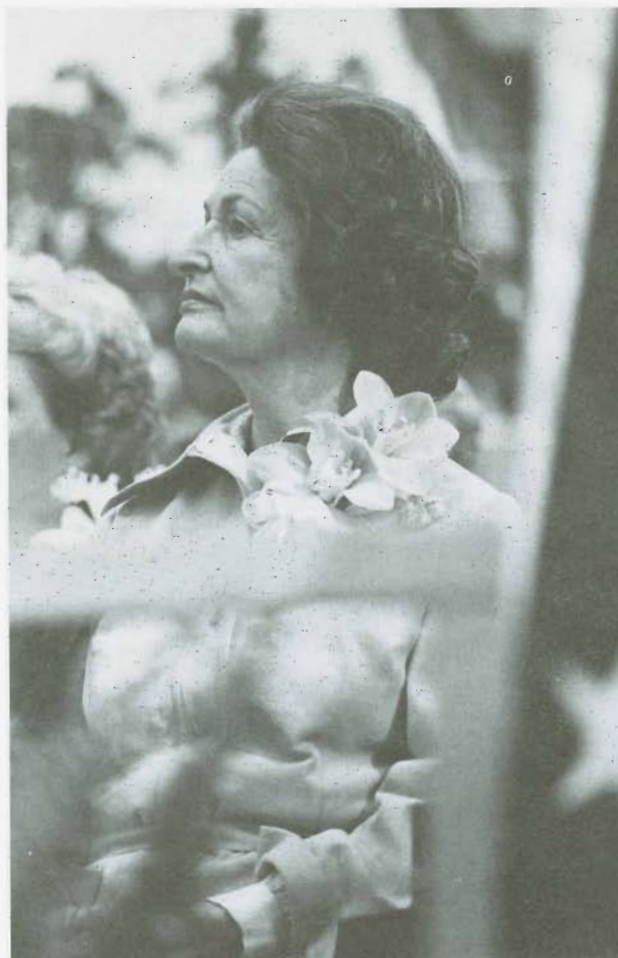
Lady Bird Johnson